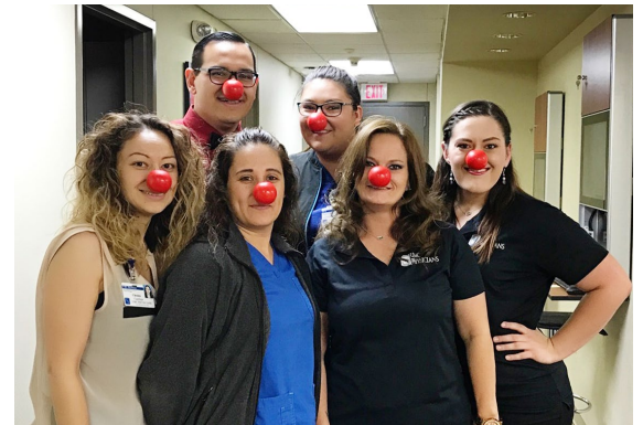
UMC Northwest Pediatrics participating in Red Nose Day